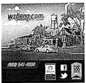
(Link to: http://www.lmc.org/ads/102408)